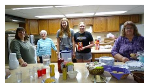
Youth help with Lenten Soup Suppers. Thanks to adults and youth.