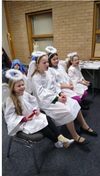
Christmas Pageant & decorating the tree