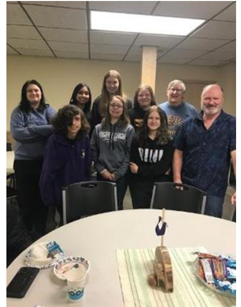
High School Release Time class.